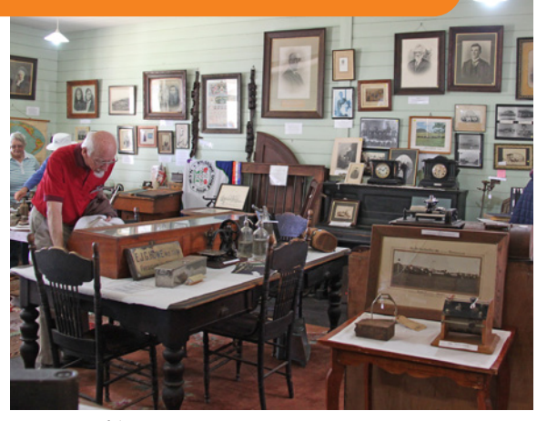
Main room of the Museum