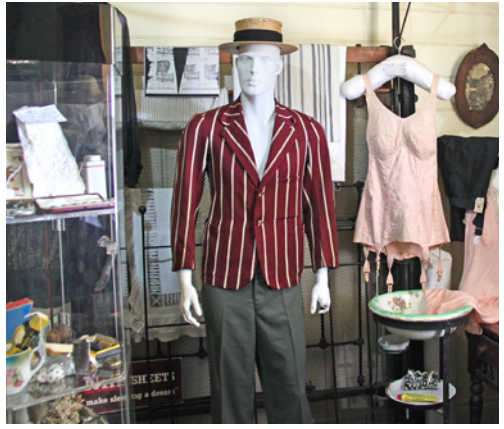
Above: Exhibits at the Cottage Museum