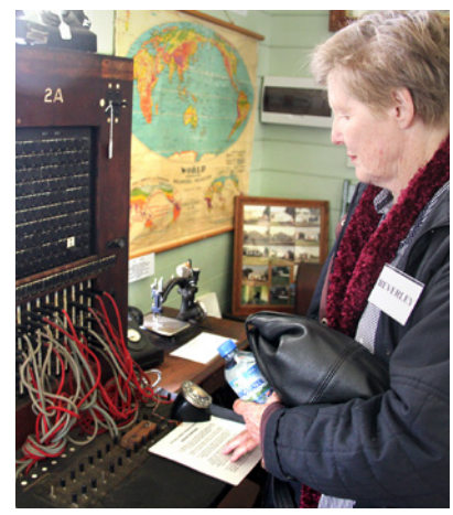
Manual Telephone Exchange